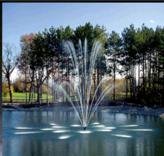
Lake & Pond Management Stormwater Harvesting & Storage