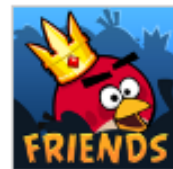
Angry Birds Friends